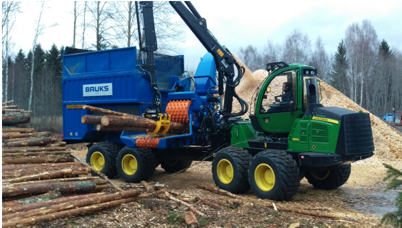
MOBILE CHIPPER 806.3 STC