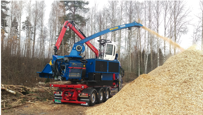
MOBILE CHIPPER 806.3 ST